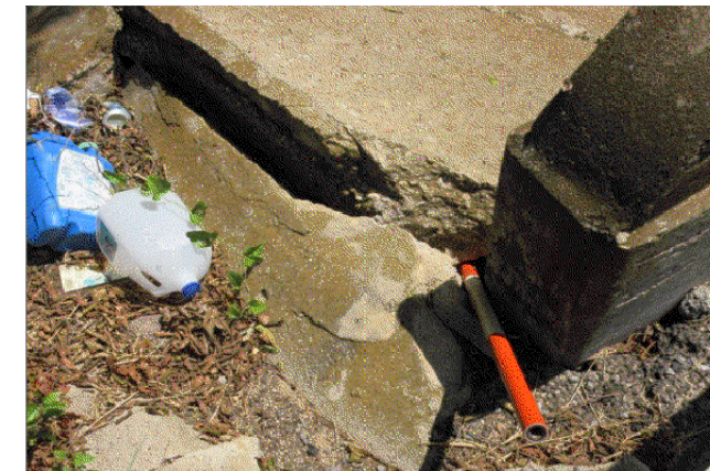
Note: Embankment erosion has undermined top of concrete riprap at NE corner approx. 2', causing the top corner of riprap to break away.

UNDERMINING RIPRAP SE CORNER Looking N IMG. 0704