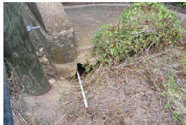
Note: Embankment erosion has undermined top of concrete riprap at SE corner approx. 3'.

Sta. 175+34 - 180+04 3 Span Continuous Steel Unit on Concrete Pipes & 6 Simple Reinforced Concrete Pan Girder Spans On Steel Pile bents