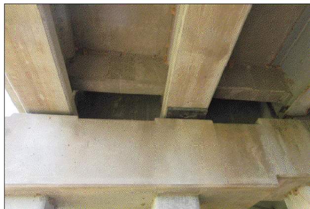
SLIPPED BEARING PAD AT BENT 2 Looking W

DATE: 14 AUG 2019 COUNTY: 047 CONT-SEC: 0257-05 STR: 028