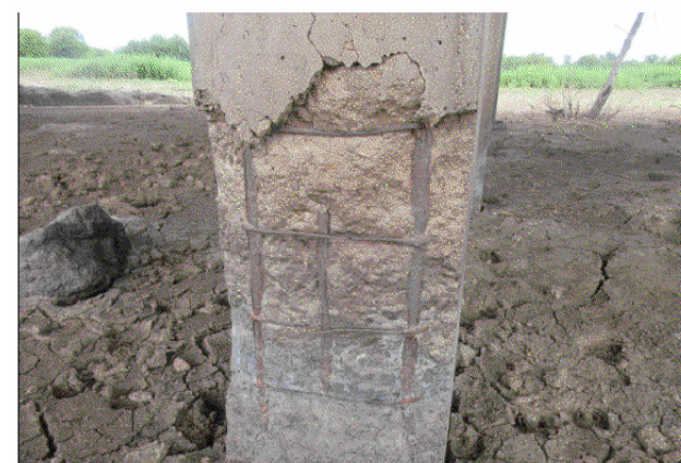
SPALL AT BENT 4 PILE Looking n