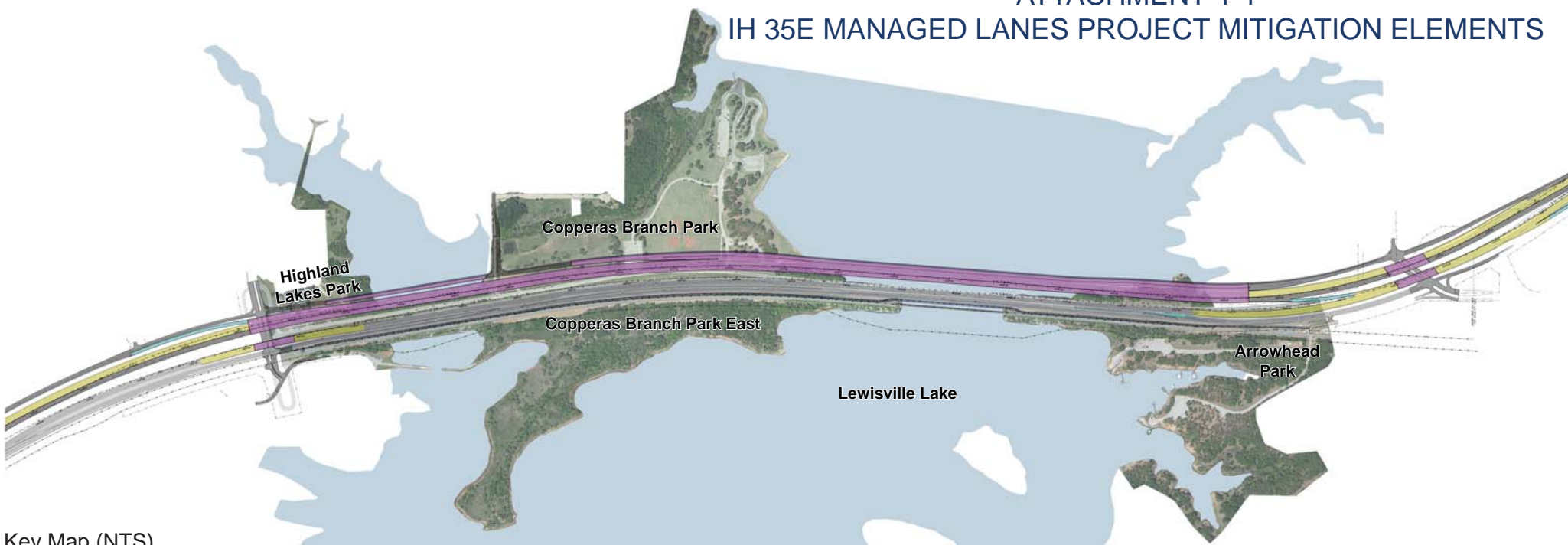
Key Map (NTS)