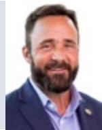
Mayor Cole Stanley City of Amarillo