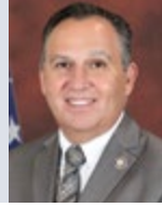
Mayor Alvaro "Al" Arreola City of Del Rio