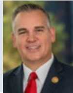
Mayor Tray Payne City of Lubbock