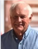
Mayor Robert Moore City of Big Spring