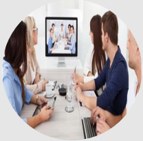
Program Specific Webinar