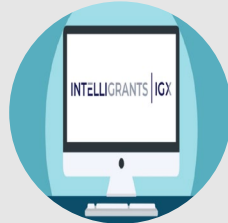
Applications Due in IGX