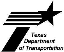
Exhibit A DESIGN-BUILD AGREEMENT SITE INVESTIGATION ON HIGHWAY RIGHT OF WAY IN THE BEAUMONT AND HOUSTON DISTRICTS

_____ is giving written notice of proposed Work to take place within the Right of Way (“ROW”) of SH 99 Grand Parkway Segments H, I-1 and I-2 in Chambers, Harris, Liberty, and Montgomery Counties, TX as follows: