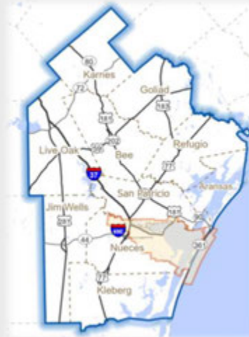
2027 - 2030 Rural TIP 9

Projects included in the 2027-2030 Rural TIP for the Corpus Christi District are listed by county at the bottom of the webpage where you located this presentation. On the left you see a sample of the county list. Each county packet is a handout set including a county map and project list. You can review each of the counties you are interested in. The map on the right shows you the location of each county within the Corpus Christi TxDOT District.