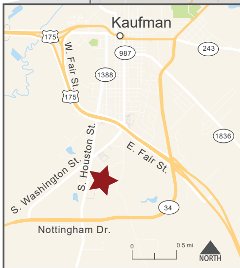
Detail of Meeting Location