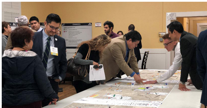
Public Meeting Series 2, January 2019