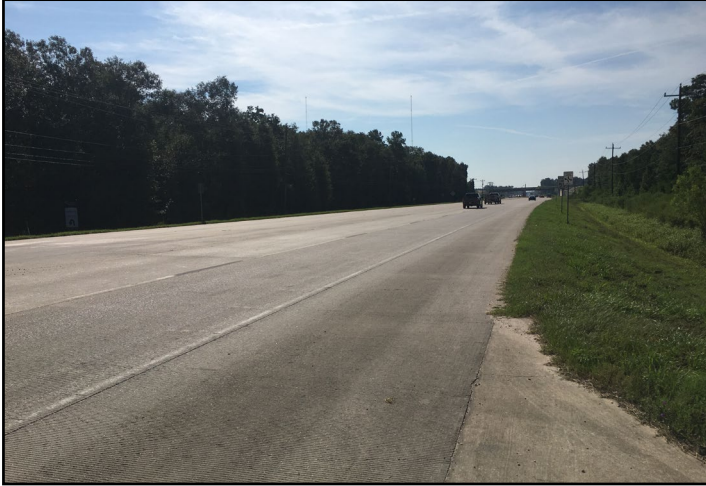
Near the northern end of FM 1314

In-Person Public Meeting Thursday, February 10, 2022, 5:30 P.M. through 7:30 P.M.