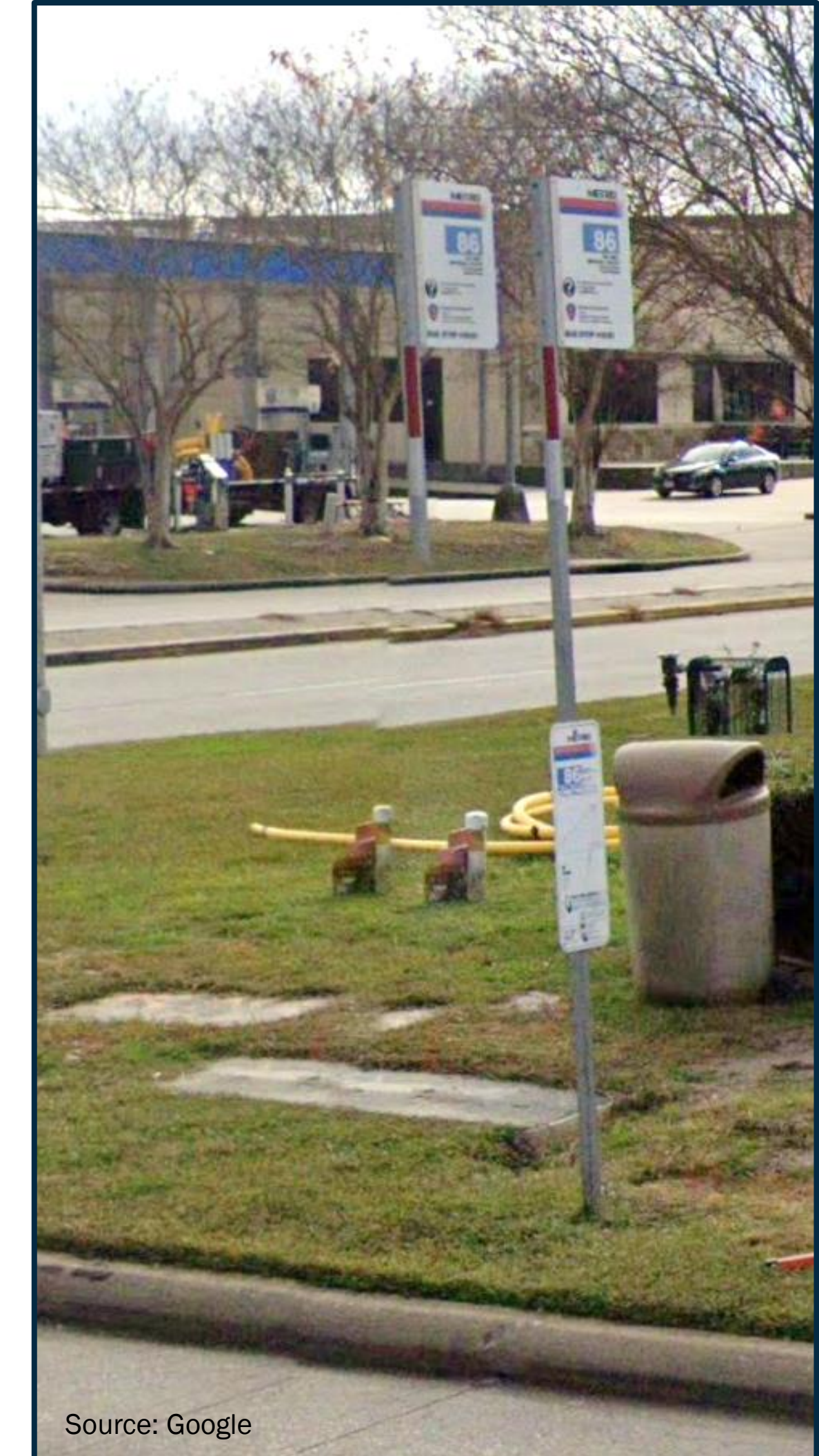
Example photo of existing Metro bus stop along FM 1960 with no concrete pad