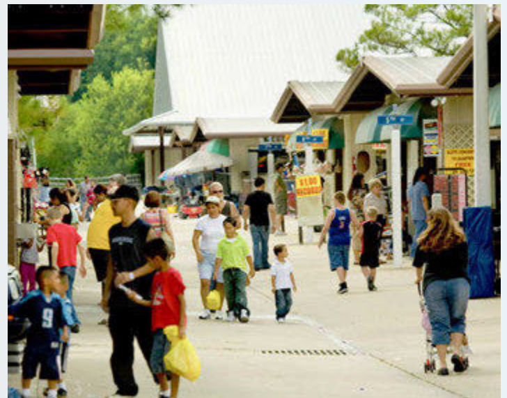
New pedestrian enhancements at all crossings and connections to current pedestrian elements.