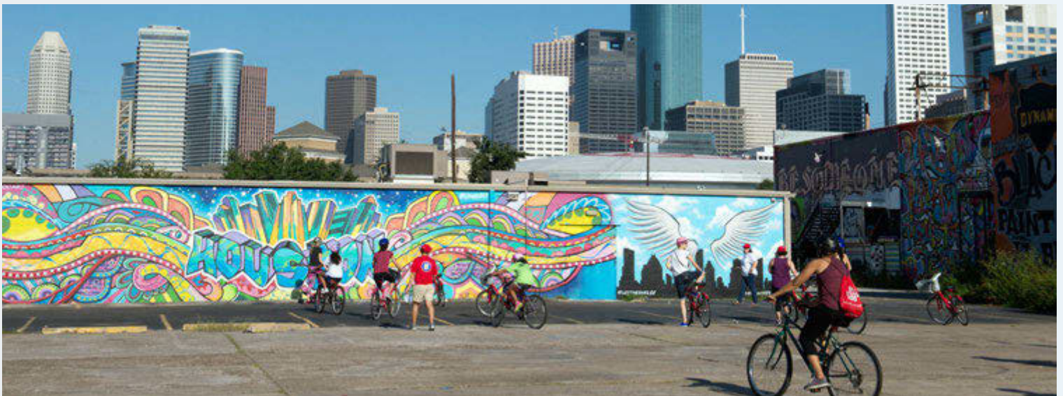
New pedestrian and bicyclist facilities can build neighborhood connections.

Whether these households are renters or homeowners on fixed incomes, providing these essential home improvements is part of TxDOT's effort to keep residents in their homes so they can continue to contribute to their community's social fabric.