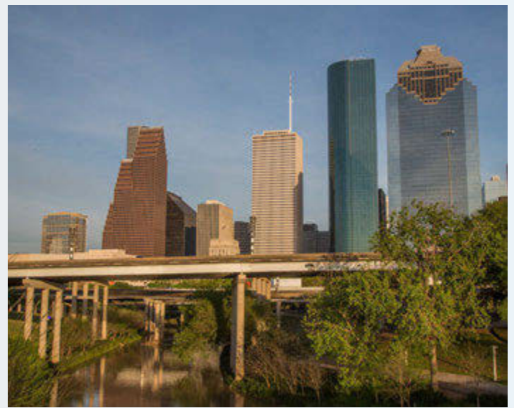
The North Houston Highway Improvement Project is the largest transportation project in our city's recent history.

TxDOT's goal is to help households and individuals maintain their current social support networks. Disruptions associated with moving can affect a resident's access to a strong social structure built over time. This can include community activities (church and school) and other regular routines such as grocery shopping, childcare, and medical services. Individual circumstances will vary, but minority, low-income and limited English proficiency populations may be especially vulnerable to such impacts. TxDOT will work diligently to try to avoid such effects from occurring.