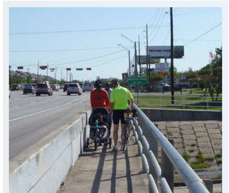
New pedestrian and bicyclist facilities can build neighborhood connections.

These enhancements to connectivity in the project plans are consistent with many local government and neighborhood plans that are increasingly emphasizing walkability as a part of overall neighborhood livability. The NHHIP will incorporate the City of Houston Bike Plan on city streets within the project area.