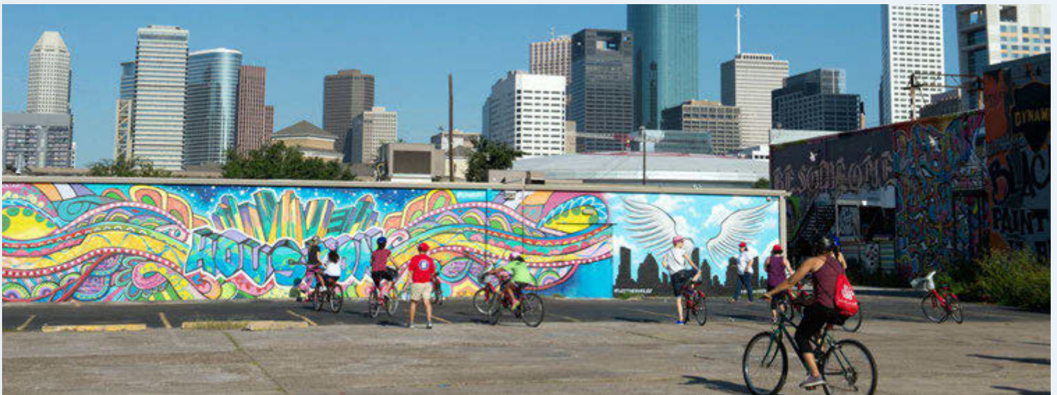
New pedestrian and bicyclist facilities can build neighborhood connections.

Whether these households are renters or homeowners on fixed incomes, providing these essential home improvements is part of TxDOT's effort to keep residents in their homes so they can continue to contribute to their community's social fabric.