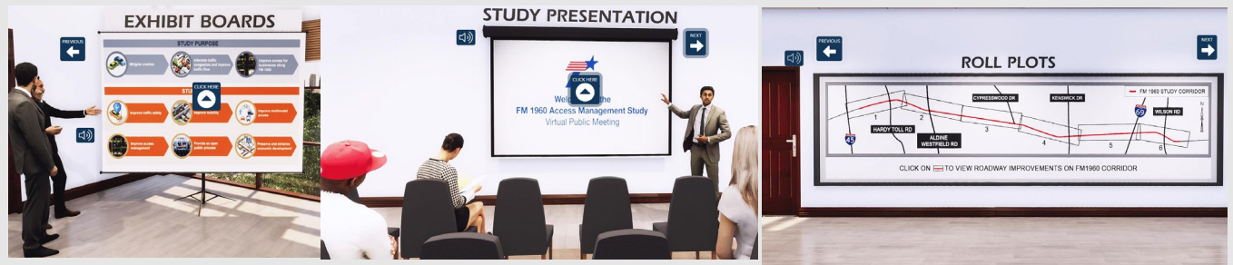
FM 1960 Access Management Virtual Public Meeting