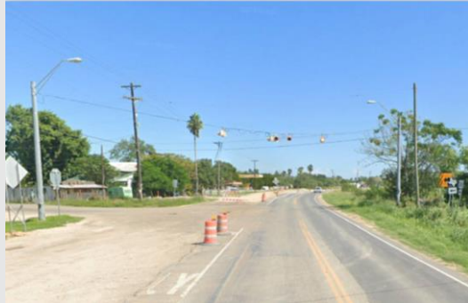
US 281 (Military Highway) near the FM 732 intersection