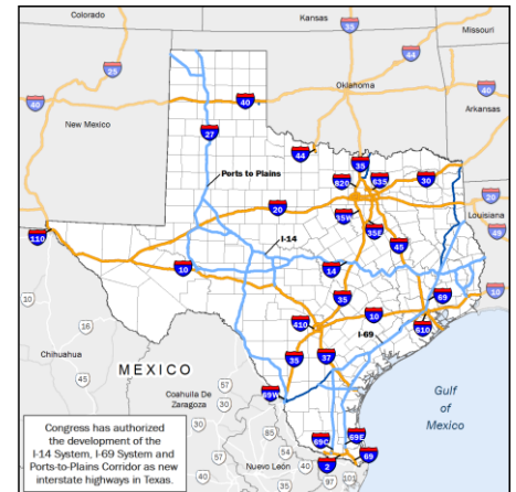
Interstate Highways in Texas

The Interstate 14 (I-14) system in Texas is part of an extended corridor across Texas, Louisiana, Mississippi, Alabama, and Georgia that will be upgraded to interstate standards. This new interstate highway system, authorized by Congress, will improve mobility between urban and rural areas, military installations, maritime ports and economic sectors, including freight, energy, timber and agriculture. This new interstate system would enhance connectivity in the United States. It would improve mobility between urban and rural population centers, military installations, maritime ports, and economic sectors including energy, freight, timber, and agriculture. The corridor is planned to be developed incrementally through a series of upgrades to interstate standards. In Texas, the I-14 system is projected to be over 1,000 miles long once it is designated and added to the Interstate Highway System. To date, approximately 25 miles of highway have been designated as I-14 from I-35 in Bell County to US Highway 190E in Coryell County, in the Killeen-Temple region.