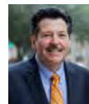
Hon. Pete Saenz, Mayor, City of Laredo