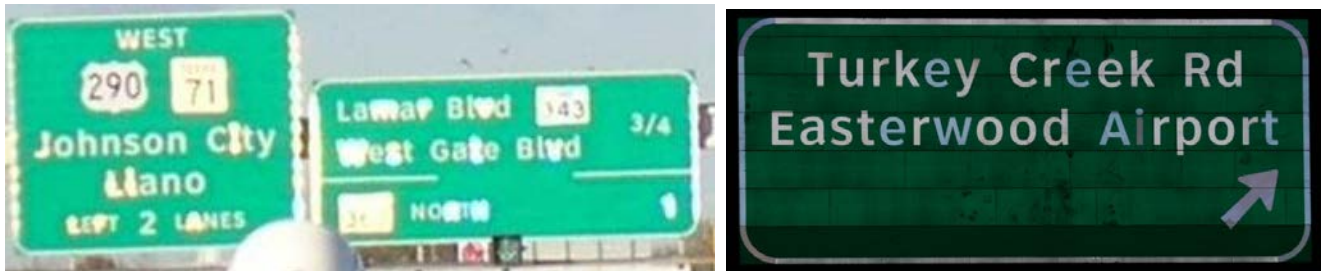
Figure 1: These signs do not exhibit uniform color and reflectivity during the day and at night.