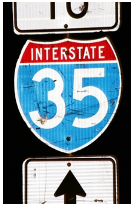
Figure 2: Day time and night time appearance of damaged signs.